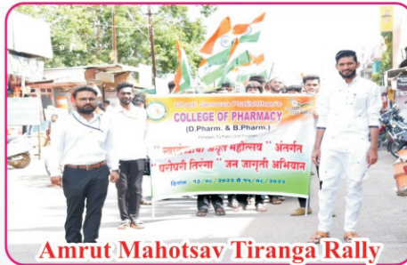
Amrut Mahotsav Tiranga Rally