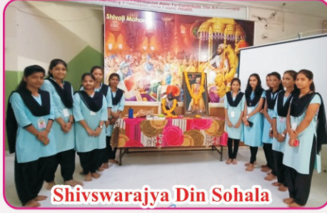
Shivswarajya Din Sohala