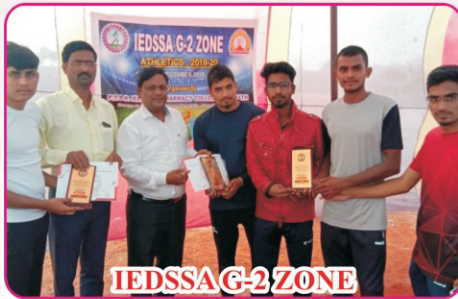
IEDSSA G-2 ZONE