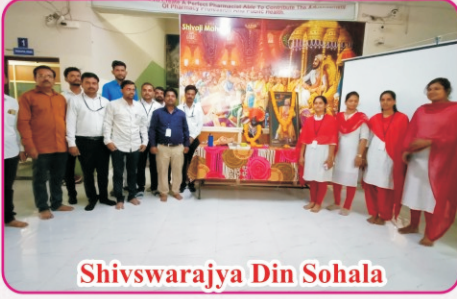
Shivswarajya Din Sohala