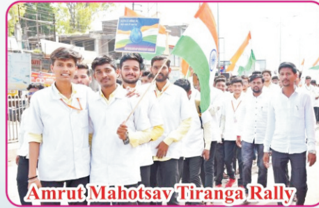
Amrut Mahotsav Tiranga Rally