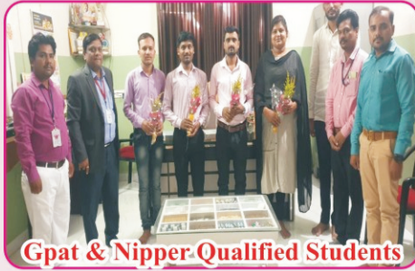
Gpat & Nipper-Qualified Students