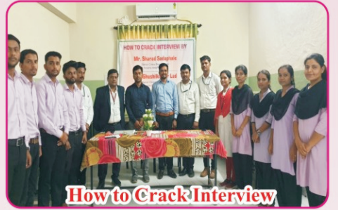
How to Crack Interview