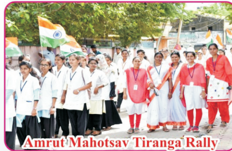
Amrut Mahotsav Tiranga Rally